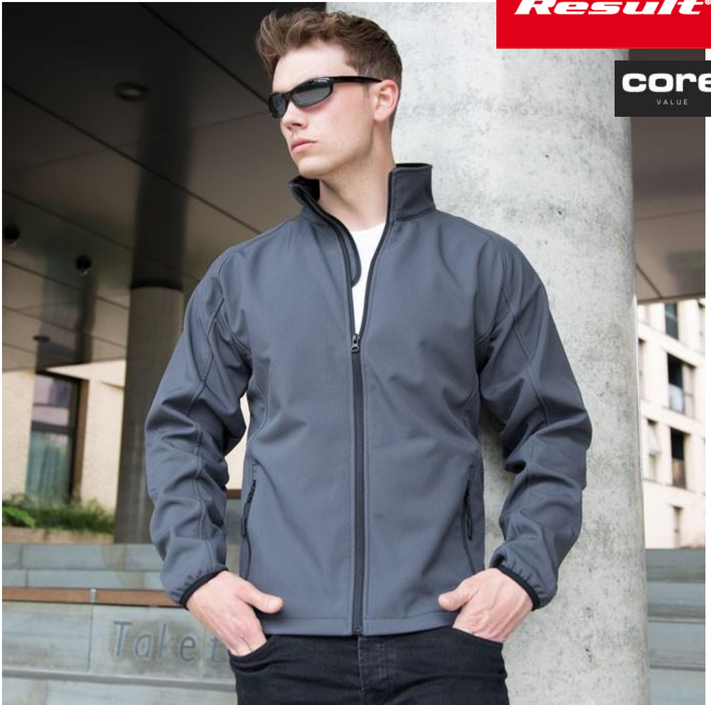
R231M MENS PRINTABLE SOFTSHELL