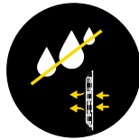
WATER RESISTANT & BREATHABLE