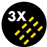
TRIPLE STITCHED SEAMS WITH LIFETIME WARRANTY