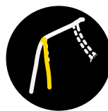
SET IN SLEEVE