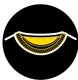
HALF MOON YOKE